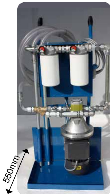
FT106, FT107 & FT108