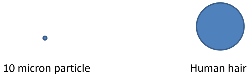
Relative sizes of particles